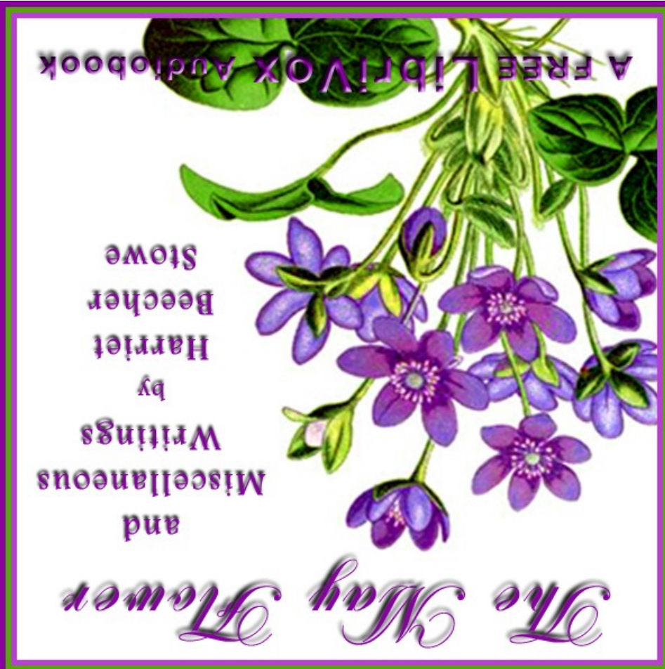
Cover Illustration: "Anemone hepatica" From Favorite Flowers of Garden and Greenhouse 1896. Cover design for Librivox Audiobooks by Michele Fry

NOTE: Easy Folding Instructions for this Origami CD case, including step by step photos, can be found here . Can also access from the LV Wiki page, CD Covers.